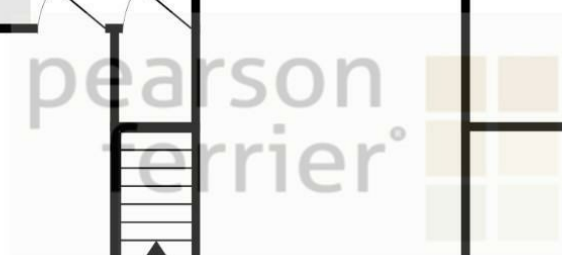
TOTAL FLOOR AREA: 728 sq.ft. (67.7 sq.m.) approx.

Whilst every attempt has been made to ensure the accuracy of the floorplan contained here, measurements of doors, windows, rooms and any other items are approximate and no responsibility is taken for any error, omission or mis-statement. This plan is for illustrative purposes only and should be used as such by any prospective purchaser. The services, systems and appliances shown have not been tested and no guarantee as to their operability or efficiency can be given. Made with Metropix ©2026